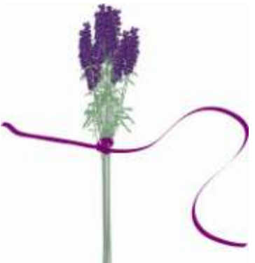
Step 2: Put the stems in a bunch, lining up the base of the flowers together.

Step 3: Tie the ribbon around the base of the flowers, leaving 10 inches of ribbon on one side of the knot and the remaining ribbon on the other side.